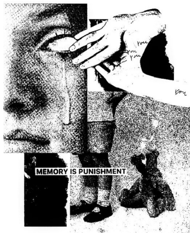
Memory is Punishment by anonymous*

"Being able to have extra funds through this program has given me time to heal and process parts of my life that I previously was too overwhelmed to address. Having funds allows me to take a step back from constantly working and address parts of my life that used to be on the back burner."