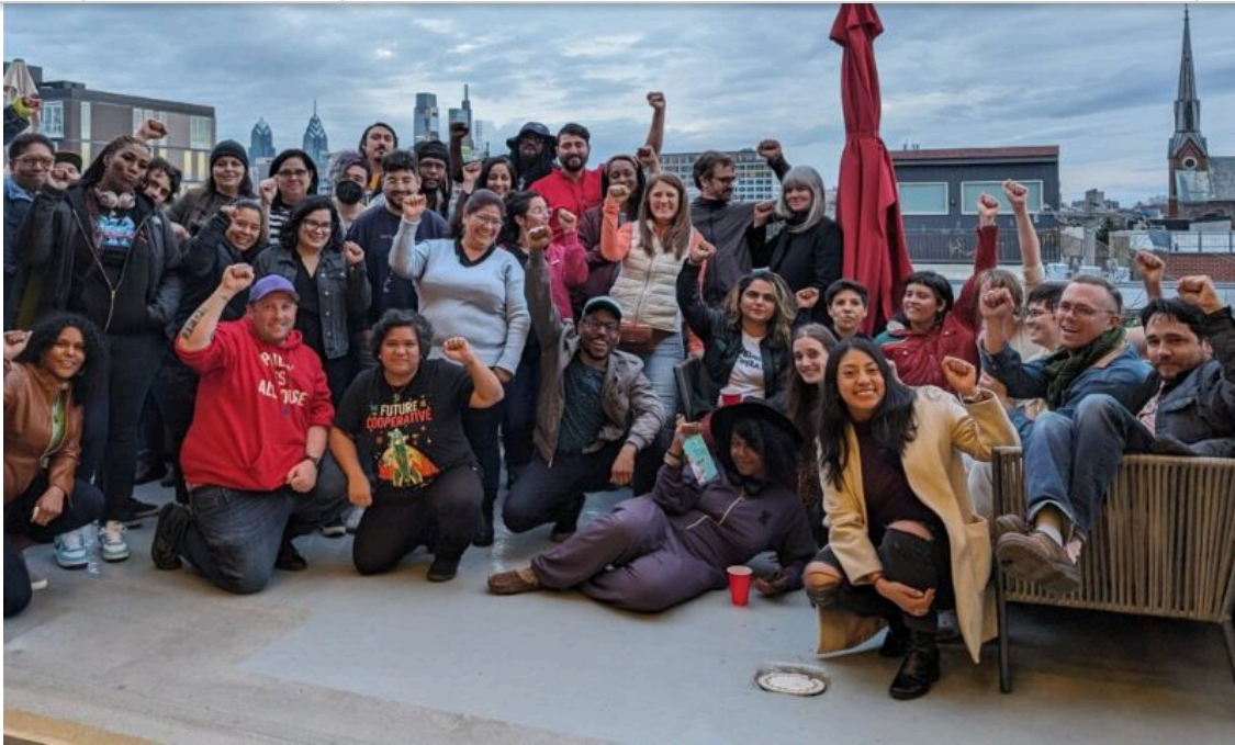
USFWC Board, staff, and friends celebrating the introduction of the National Worker Co-op Development and Support Act