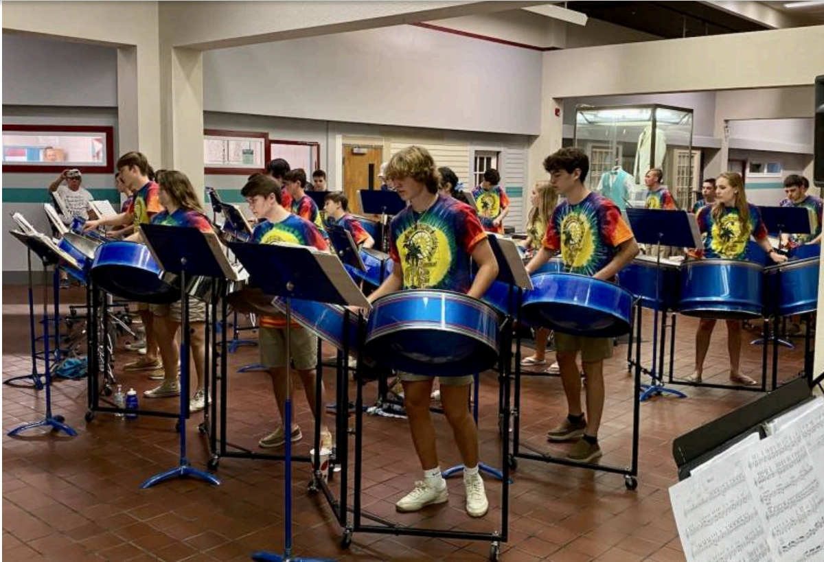
Students playing steel band music as part of GO Art!'s festival in Batavia