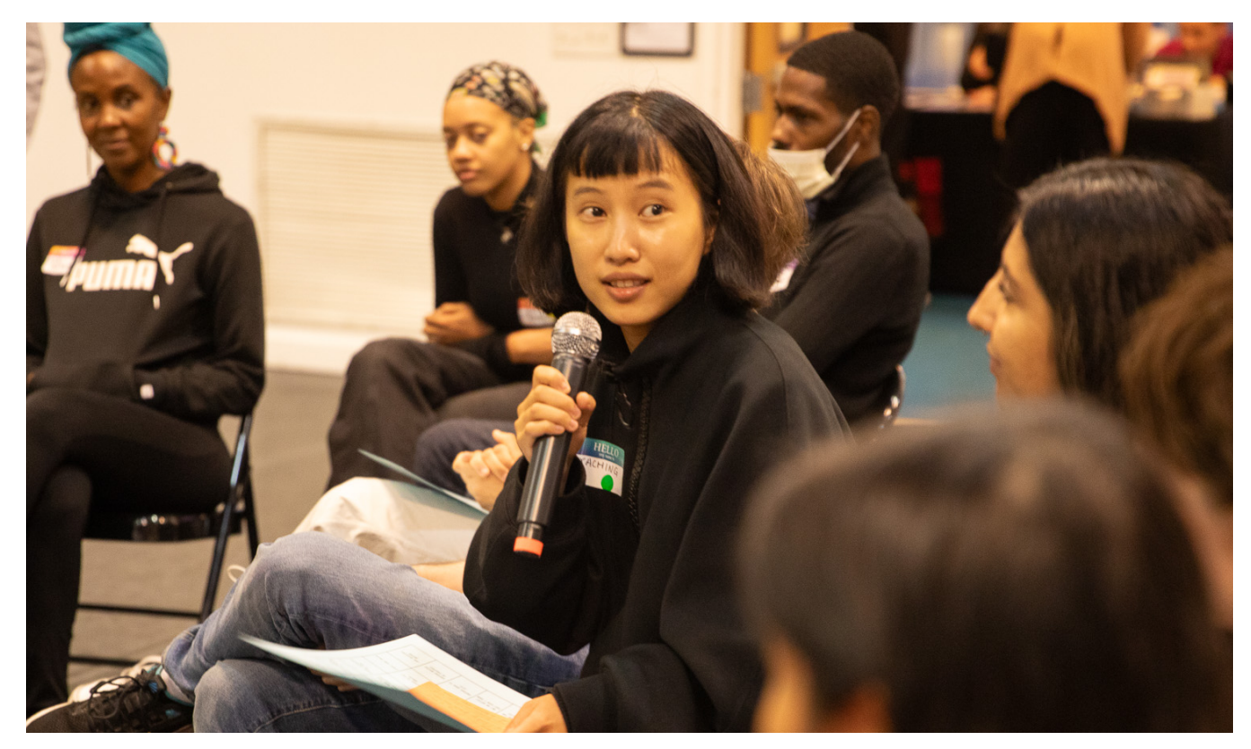
Brooklyn GI Artist Gathering

through and beyond the end of payment distribution. Even though a strong value of GI is no-strings-attached funding, a care after cash approach considers that this may not always be what best serves the needs of participants or advances the goals of the GI movement.