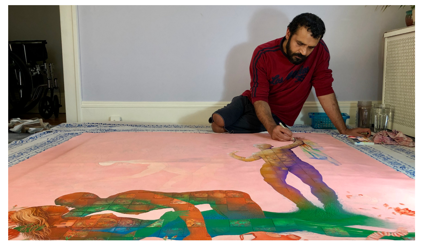
Balbir at work. Artist: Balbir Krishan

Not requiring documentation at the application stage added substantial confusion and complication at the verification stage, although artists appreciated the ease of application and CRNY believes this was the best approach. Many applicants did not submit documentation in a timely way, sometimes because they interpreted the notification of pre-selection as acceptance into the program. Others who ended up not qualifying after being told they were pre-selected were upset for a similar reason. One artist who was accepted to the program said: "the prequalifying language was confusing. It gave me a lot of anxiety that I might not get in." Other artists submitted incomplete information, which required CRNY and partners to follow up and request more or different information.